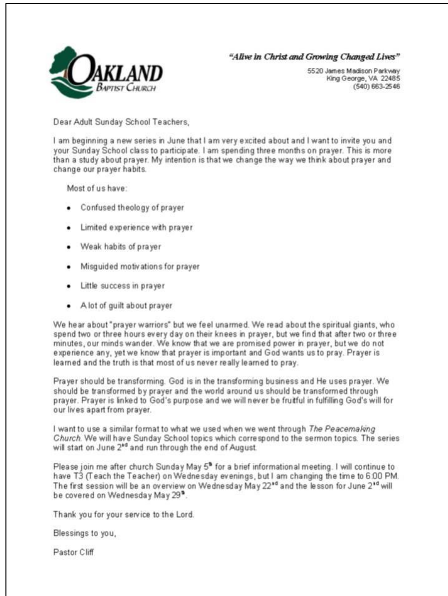
Figure A2. Letter to Adult Sunday School teachers