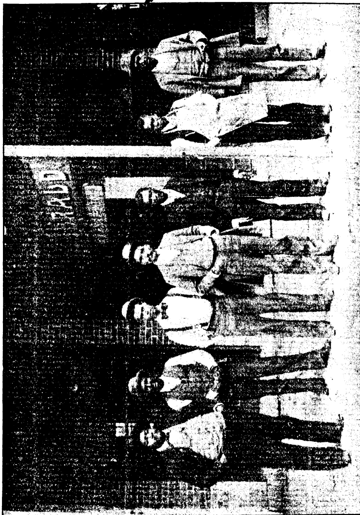
MALE FORCE IN THE HERALD OFFICE.