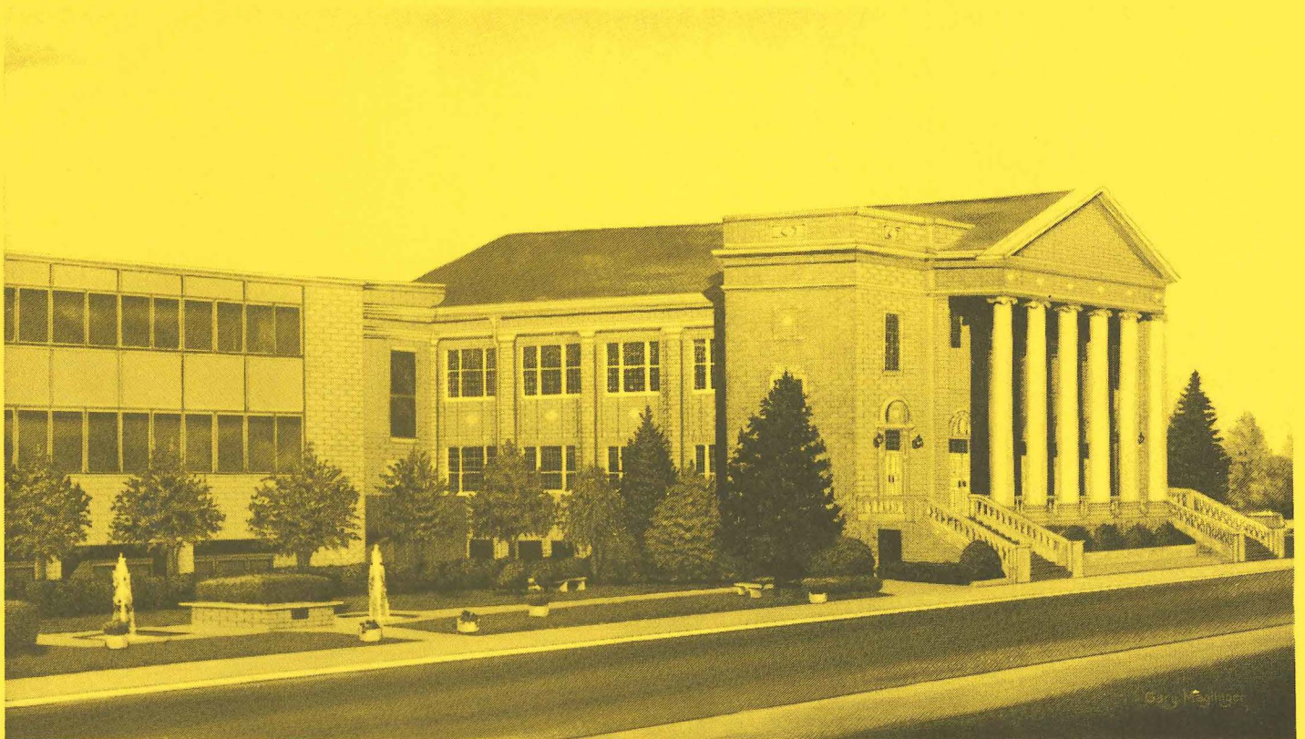
First Baptist Church, Owensboro, Kentucky

A PUBLICATION OF THE KENTUCKY BAPTIST HISTORICAL SOCIETY THE KENTUCKY BAPTIST HISTORICAL COMMISSION