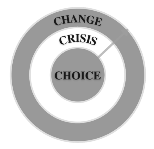
Figure 1. The three Cs of leader formation<sup>33</sup>