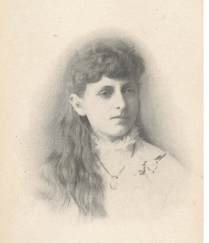
THE LITTLE BAPTIST